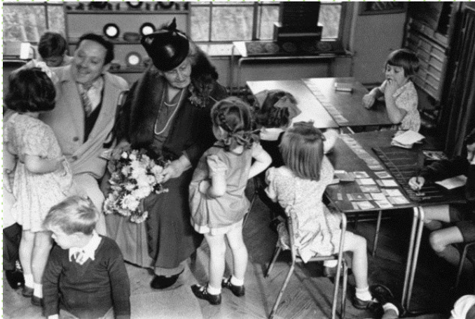
Dr Maria Montessori in a classroom (circa 1951).