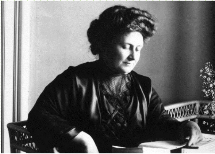
A young Maria Montessori