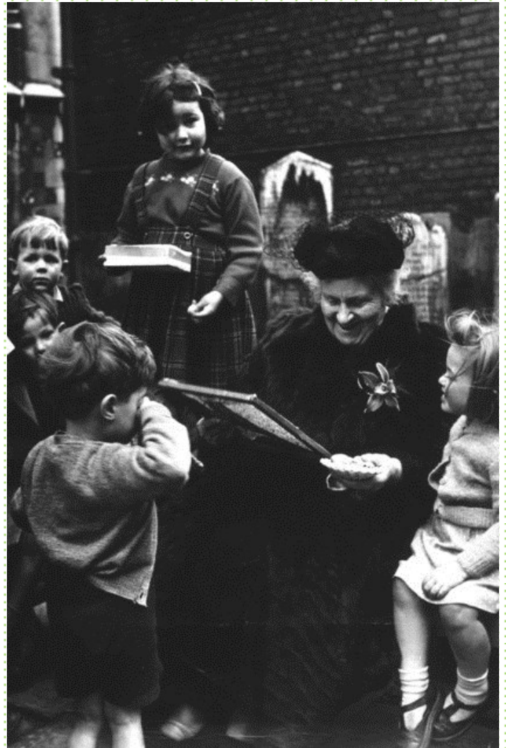
Dr Montessori with children